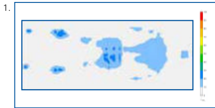
1. Test shows subject in supine position demonstrating contact measurement between key pressure points using BodiTrak mapping technology on the SPS1084 support surface. Subject: Male 5'11", 185 lb.